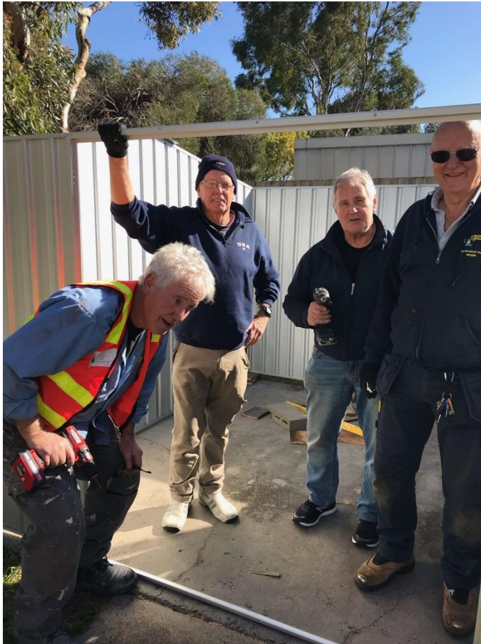
Fellow Rotarians putting up our new shed at Scout Hall in Altona on Friday 23 August